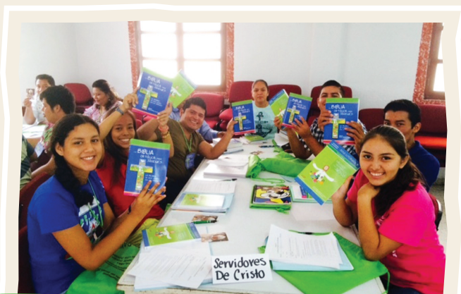
Training on biblical animation of Pastoral Juvenil , in Veracruz, Mexico

Module 1 centers on the spirituality of a ministry at the institutional level, and the theory and praxis of pastoral work done within the organizational structure of the Church. Module 2 focuses on the theory and practical skills needed in general administration, strategic planning, management of finances and human resources, stewardship and fundraising. Ministers may start the program with either module. About a third of the participants are young adults with advanced pastoral theological formation who serve in ecclesial contexts. Since the program started in 2012, 190 people have participated and 82 graduated after fulfilling the requirements of both modules. The graduates include 19 professional ministers, 35 pastoral advisers in Hispanic Ministry, and 28 pastoral advisers in Pastoral Juvenil . This program will be offered again in 2017-2018.