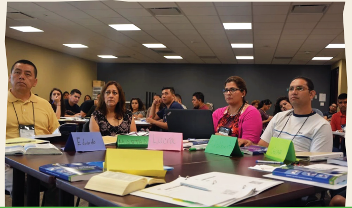
Training on Human Sexuality focused on Latino adolescents, for family and youth ministers