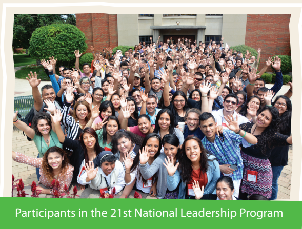
Participants in the 21st National Leadership Program