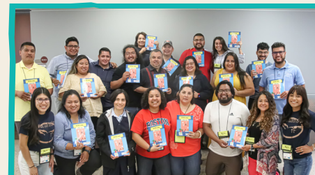
Training the Trainers for the Foundational Course on Pastoral Juvenil