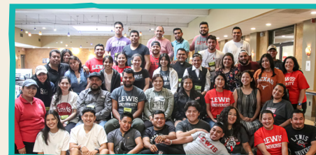
Leadership Symposium 2022